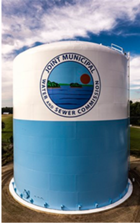
Field Erected Tank Section