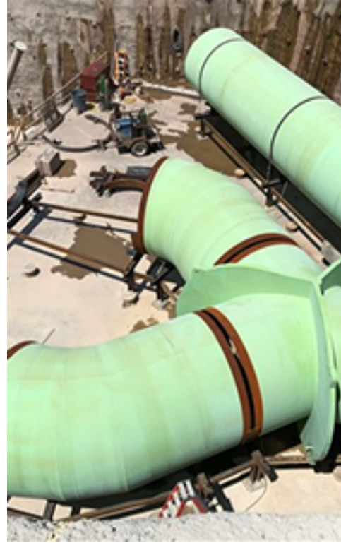
Steel Water Pipe Section