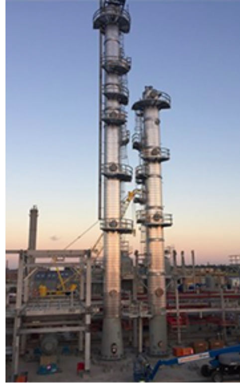
Pressure Vessel Section