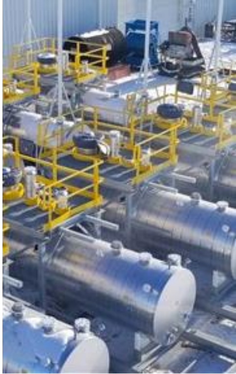
Shop Fabricated Tank Section