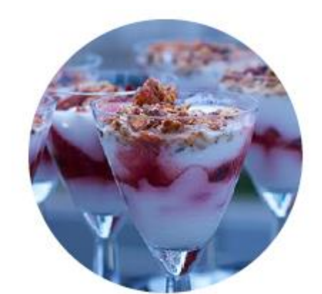
Breakfast Parfait Sponsor