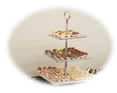
Dessert Station Sponsor