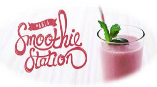
Smoothie Station Sponsor