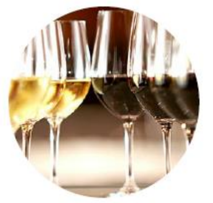
Wine Station Sponsor