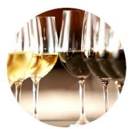
Wine Station Sponsor