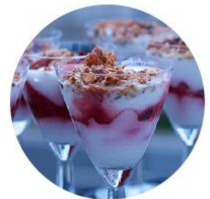
Breakfast Parfait Sponsor